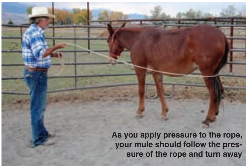
As you apply pressure to the rope, your mule should follow the pressure of the rope and turn away

As you apply pressure, the mule will probably stop due to the pressure on his halter. Ask the mule to continue moving forward until he turns towards the fence. Continue this until